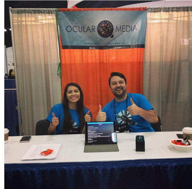
Academy 2018 San Antonio