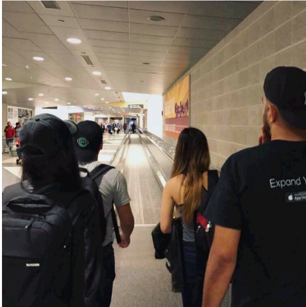
Chicago Academy 2017