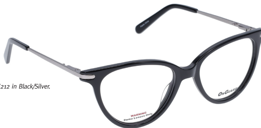
OnGuard C212 in Black/Silver.