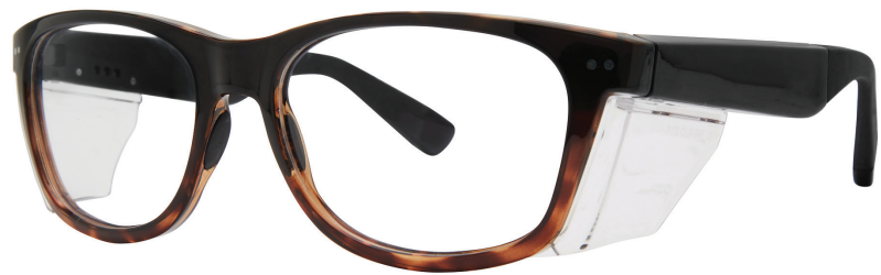
Pentax Classic 56 Gloss Demi.