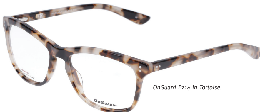
OnGuard F214 in Tortoise.

How can independent ECPs capitalize on the current climate? Said the spokesperson, “With a focus on actually prescribing a pair of Rx Safety frames when appropriate, ECPs are not only protecting a patient’s eyesight—the most important reason to make this recommendation—but also are providing protection for expensive fashion frames when the patient is on the job. This is a win-win for both the patient and practice.” ■