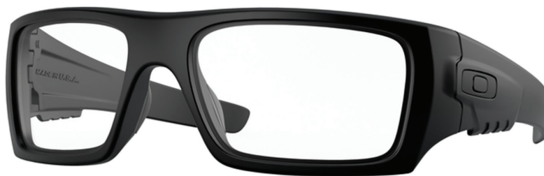
Oakley DetCord is Made in the USA.