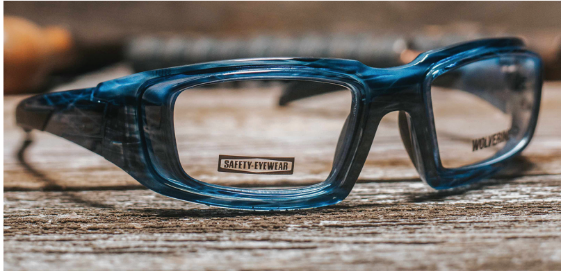
Wolverine Safety Eyewear W34 in navy blue crystal.

Wehlage also noted, “Wolverine has been having great success in our lightweight TR90 safety models (W035/ W036). The sport styled wraps with double injected rubberized tips and nose pads conform and provide comfort to the face.” ■