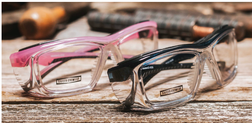
Wolverine Safety Eyewear W36.