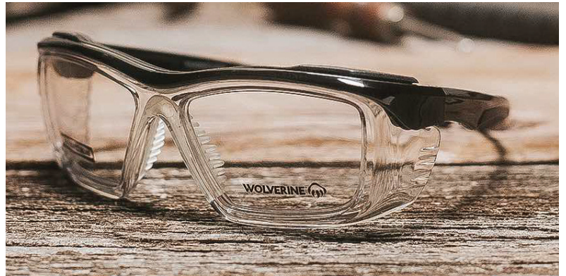
Wolverine Safety Eyewear W36 in black crystal.