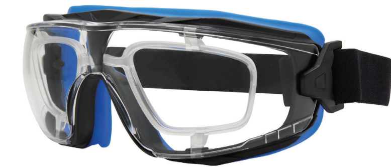
Pentax GT20 Goggle with Rx Insert.

Scott also noted, "As always, a prescription safety eyewear patient can carry many additional revenue opportunities for an independent eyecare professional. Those patients often need a new refraction. Additionally, they will normally need new dress eyewear or prescription sunwear and they may have a spouse or children who need eyewear. These opportunities are often the result of a local manufacturing employer sending their employees to local eyecare professionals—and