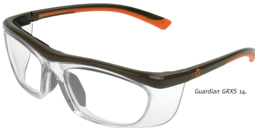
Guardian GRXS 14.

SightProtect, the company said, also drives local employees and their families to provider practices, through employer programs and their dedicated practice locator, and unlocks opportunity for increased revenue through second pair sales.