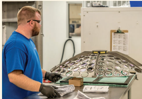
A technician inspects lenses after applying anti-reflective coating at the new VSPOne Sacramento lab.

VSP Optics Group re-engineered and expanded its VSPOne Optical Technology Center